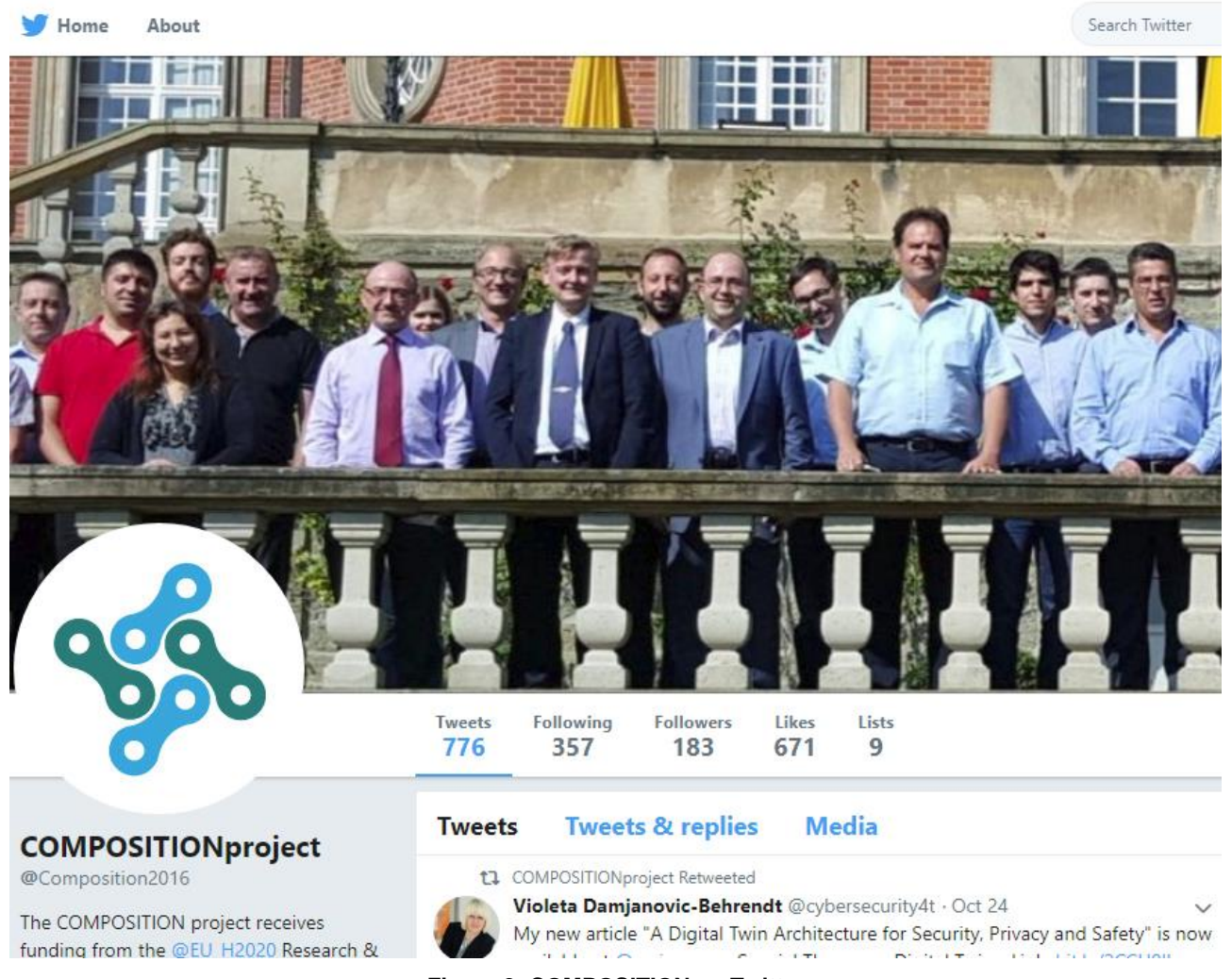
Figure 2: COMPOSITION on Twitter

As can be seen in the screenshot in Figure 2, COMPOSITION presently has 183 followers on Twitter1.