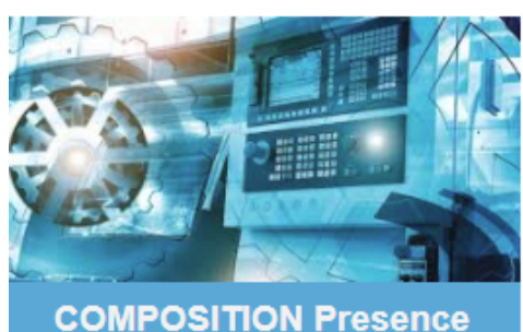
at ConnectedFactories Dissemination event

On 5 and 6 February, EFFRA organised a dissemination event on digital platforms in manufacturing in association with the ConnectedFactories Coordination and Support Action. Our project had a double presence there in the public and the closed sessions.