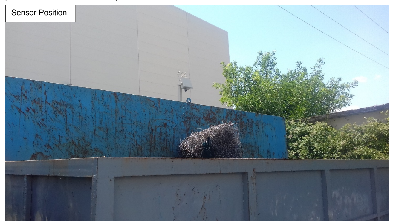
Figure 2: UC-KLE-4 sensor's position

facilities. The photos below show the installed sensor (Figure 2) and gateway (Figure 3) in their actual position at KLEEMANN's factory.