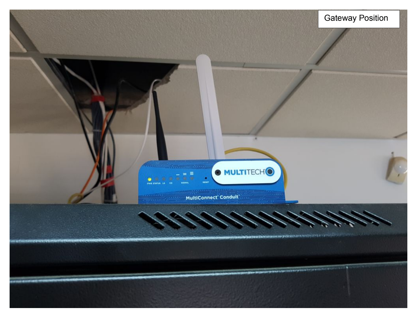
Figure 5: UC-ELDIA-1 gateway's position