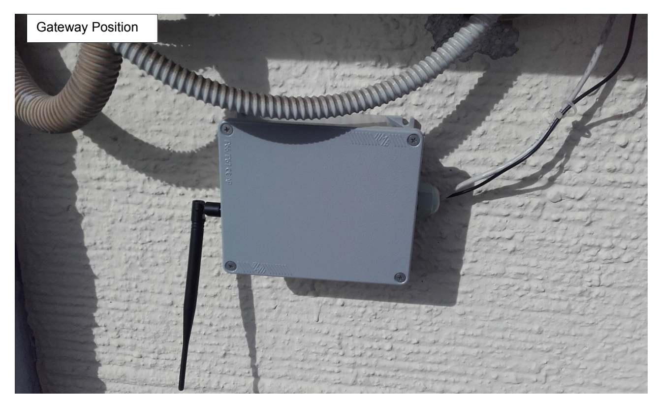
Figure 3: UC-KLE-4 gateway's position