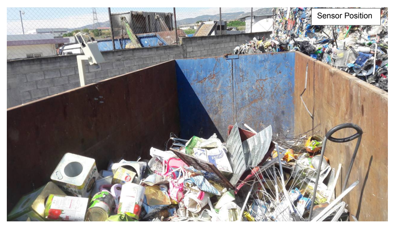
Figure 4: UC-ELDIA-1 sensor position